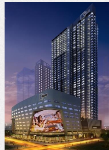
Eton WestEnd Square