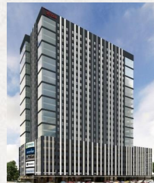
Centris Cyberpod Five