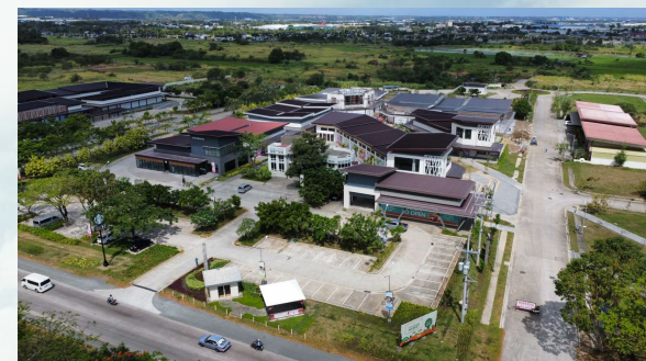
Eton City Square, Laguna